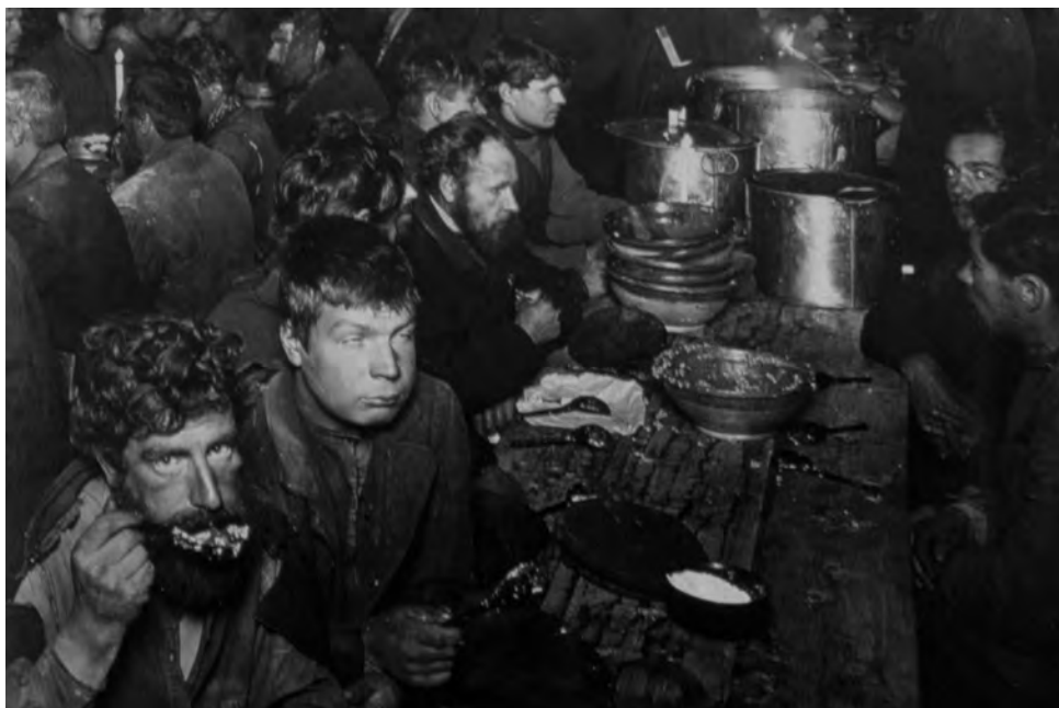
A boarding house for industrial workers, Moscow 1911.

11 Study the photograph, and then answer the questions which follow.