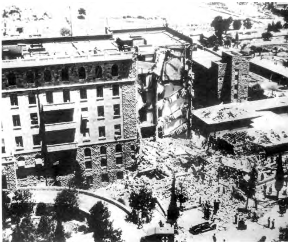
The King David Hotel in Jerusalem following a terrorist attack, 1946.

20 Study the photograph, and then answer the questions which follow.