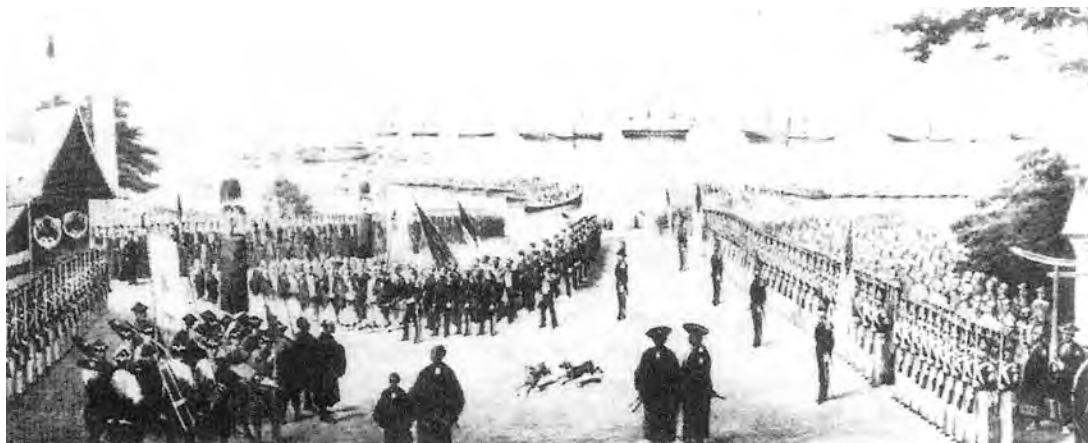
The Americans arrive to sign the Treaty of Kanagawa, 1854.