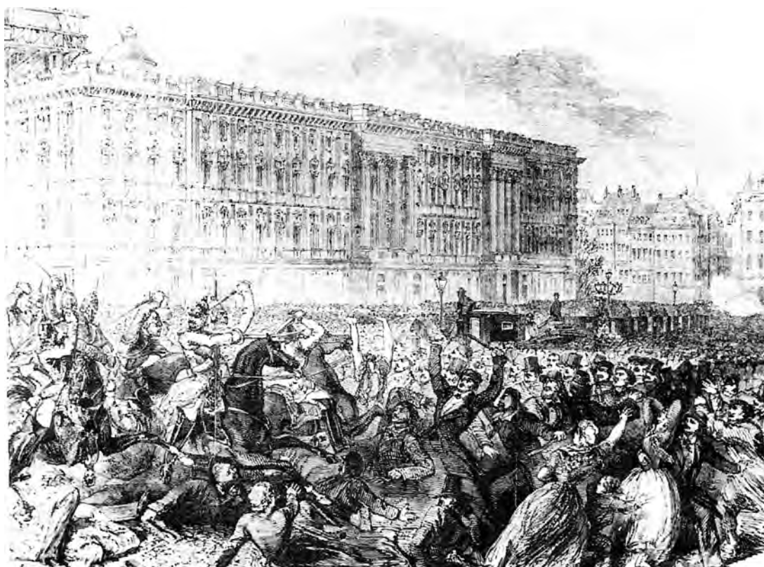
A picture showing the Prussian cavalry charging rioters in front of the Royal Palace in Berlin in 1848.