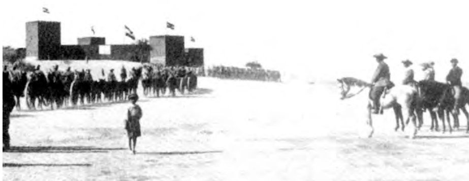
The German fort at Windhoek, 1898.

19 Study the photograph, and then answer the questions which follow.