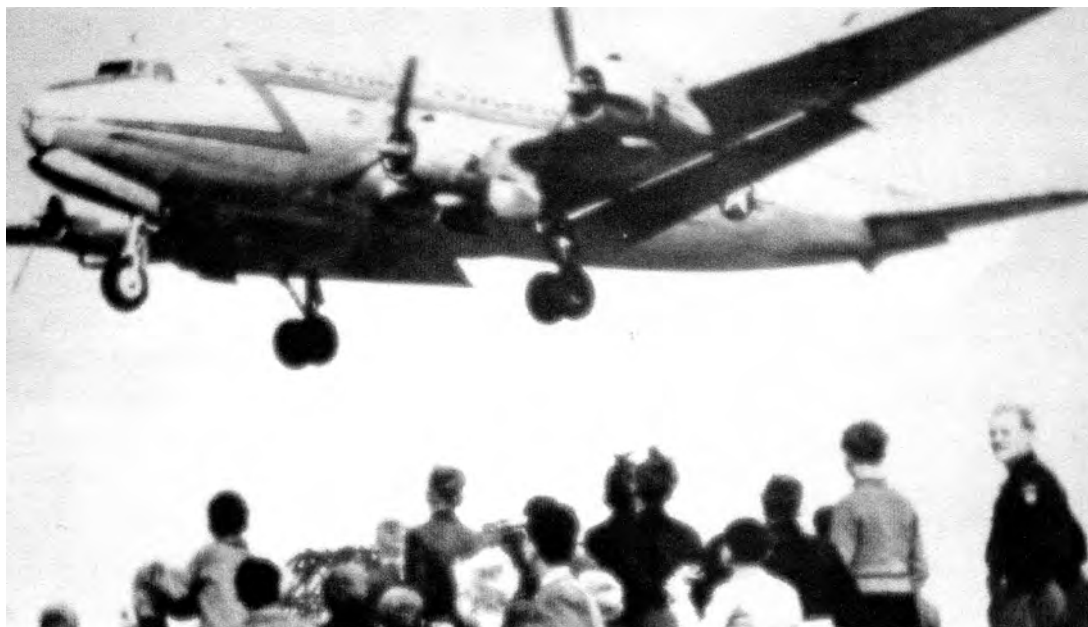
West Berliners watching a US cargo plane landing.