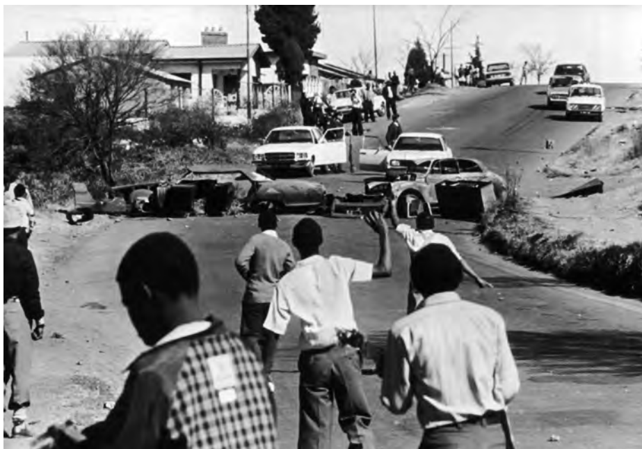
High school students on the streets of Soweto, 1976.

18 Study the photograph, and then answer the questions which follow.