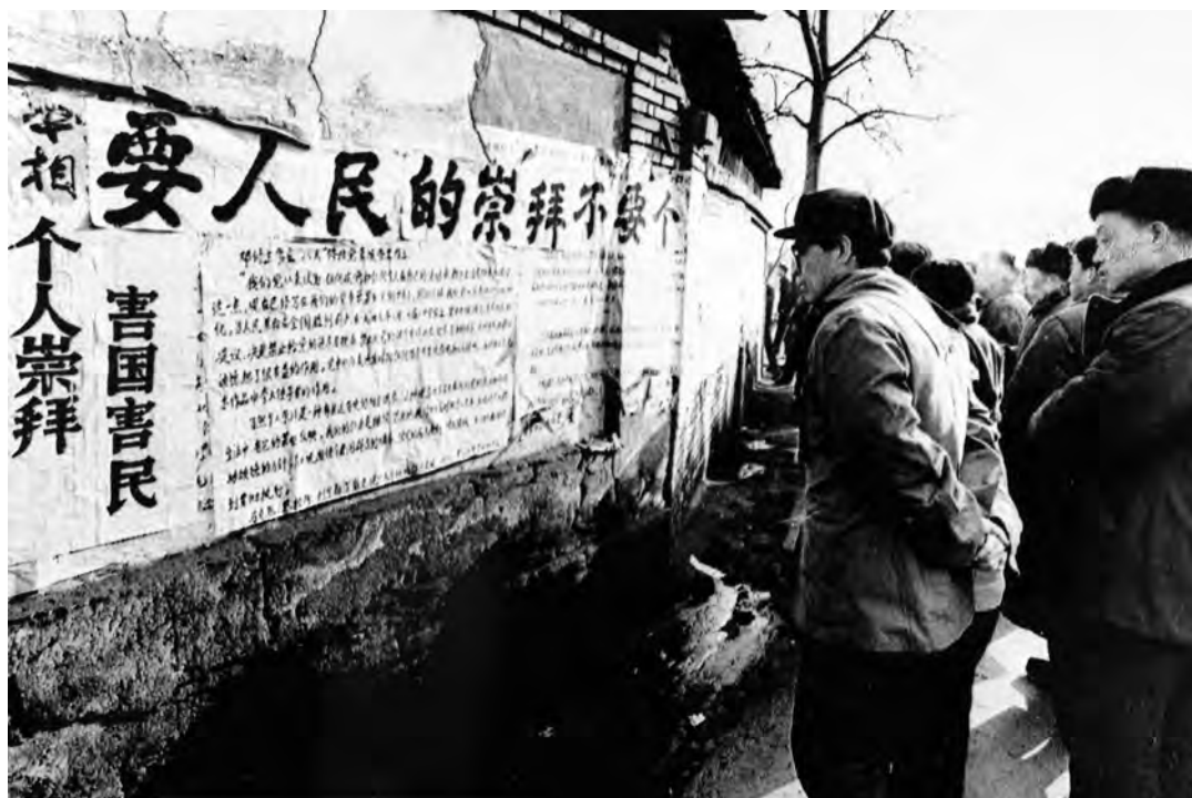
The 'Democracy Wall' in Beijing, 1979.

16 Study the photograph, and then answer the questions which follow.