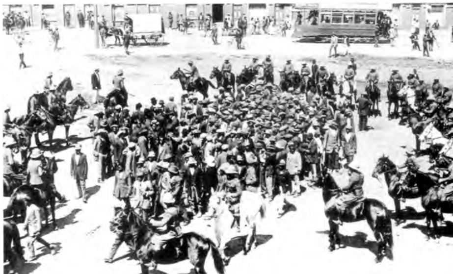
Anti-pass demonstrators being arrested in Johannesburg, 1919.

17 Study the photograph, and then answer the questions which follow.